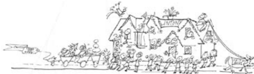
LINTON'S GIVES NEW MEANING TO "MOVING DAY"

It's true!! We will be moving and taking our wonderful home with us. During the winter, we will be moving our current buildings to our new location. Our buildings will attach to our new building so that they will face County Road 17.