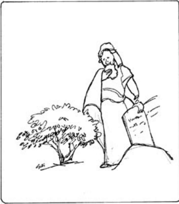
Moses and the Euonymus alatus 'Compactus'