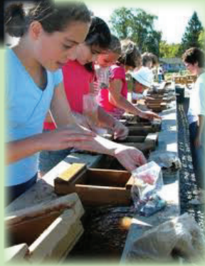
GEM STONE MINING