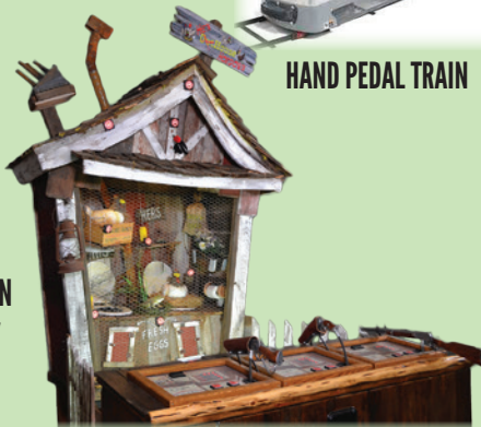
HEN HOUSE HOEDOWN SHOOTING GALLERY

Two new water attractions will be a Swan Paddle boat and Water Orbs. The 8' Water Orbs are designed to be inflated with a person inside, and will allow you to "walk on water". The swan paddle boat is large enough to accommodate 4 persons at the same time.