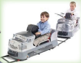
HAND PEDAL TRAIN