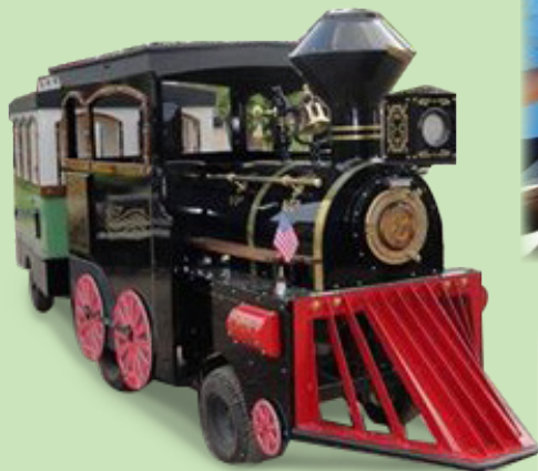
ENCHANTED GARDENS EXPRESS