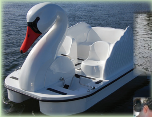
SWAN PADDLE BOAT